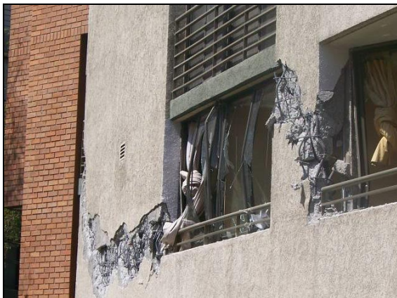
Damaged high-rise residential tower in Santiago, Chile, 2010, requiring substantial structural repairs