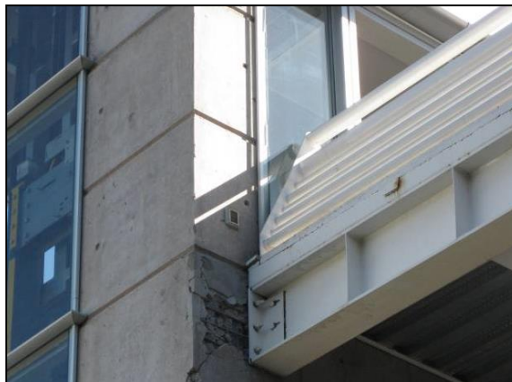
Damaged elevated walkway at Santiago International Airport, Chile, 2010; until repaired the area was off limits