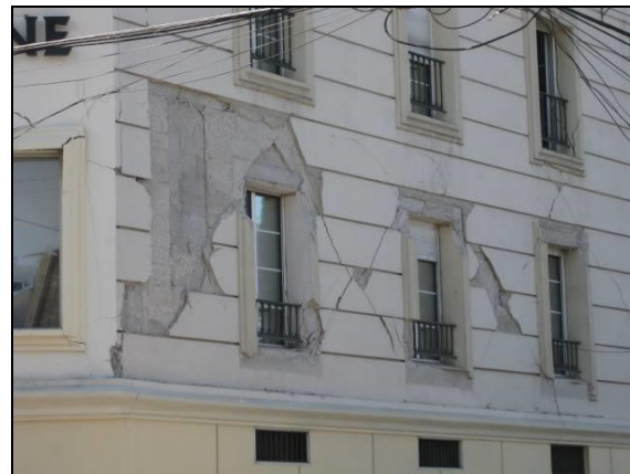
Extensive wall damage in office building in Port-au-Prince, Haiti, 2010, requiring extensive repairs before re-occupancy