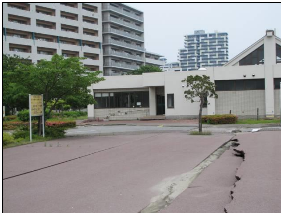
Lateral soil spreading near a community center near Tokyo, Japan, 2011; the pile-supported building survived

The following photographs from recent MRP Engineering post-earthquake investigations illustrate general types of damage and its significance.