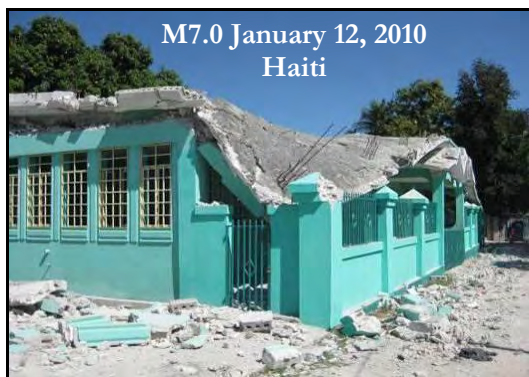
M7.0 January 12, 2010 Haiti