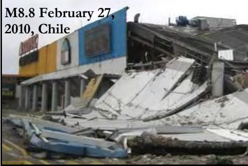
Collapsed concrete tilt-up wall panels due to weak wall-to-roof connections