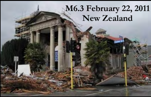
Collapsed unreinforced masonry structure in Christchurch