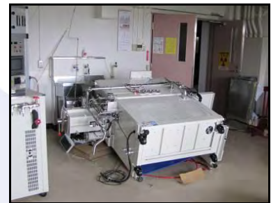
Equipment impacts: toppled unrestrained lab workstations