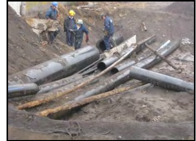
Soil impacts: repairs of piping damaged by soil liquefaction