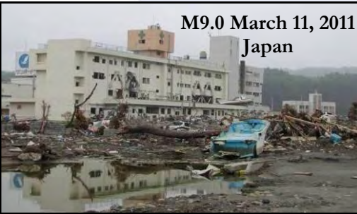
Seismically retrofitted hospital in Minamisanriku survived as a vertical (tsunami) evacuation shelter