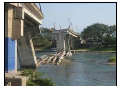
Infrastructure impacts: collapsed bridges may limit site access